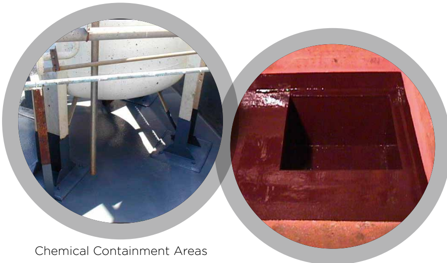
Chemical Containment Areas