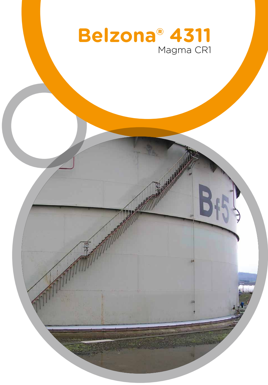
Chemical Storage Tanks

For more information, please contact your local Belzona representative.