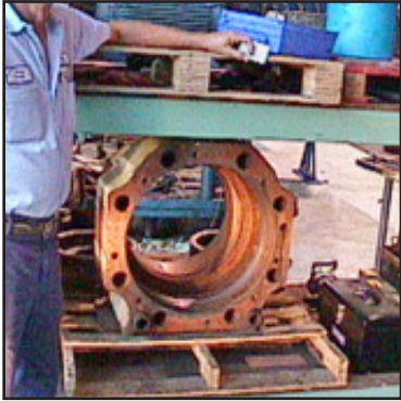
Units as received from ship