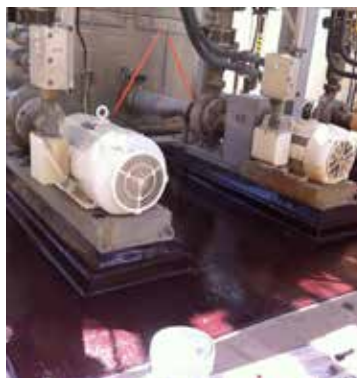
Easy brush application protects various geometries from chemical attack

Belzona 4311 can withstand the high compression and loading of vehicular and pedestrian traffic.