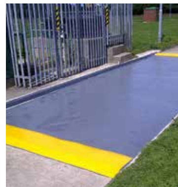
High compressive strength is ideal for chemical loading or filling areas